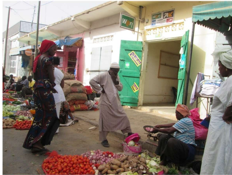
Picture 5: Money transfer services at close proximity to traders in a popular market in Louga. LARTES-IFAN

Compared to the other countries, Senegal seems to be the most (technologically) developed in terms of the DFS on offer. It too has a history of migration and the sending of remittances that infiltrates the present-day mobile money ecosystem. Some of the older, traditional means of transferring money still function alongside the newer, digital means. Informants mentioned the continued use of hand-to-hand transfers, which has an especially long history in Louga. This type of transfer makes use of intermediaries who generally belong to the same social networks (family, village, known via-via). Sending money by road via transport services also continues today, especially in (remote) rural areas without electricity and where DFS service points are almost non-existent. Sending cash through money orders at the post office was a popular system before the advent of newer monetary transfer systems such as MTOs. It was particularly used for international transfers by migrants sending money home. There is also still a prominent role for tontines when it comes to financial dealings in general (especially savings and credit).