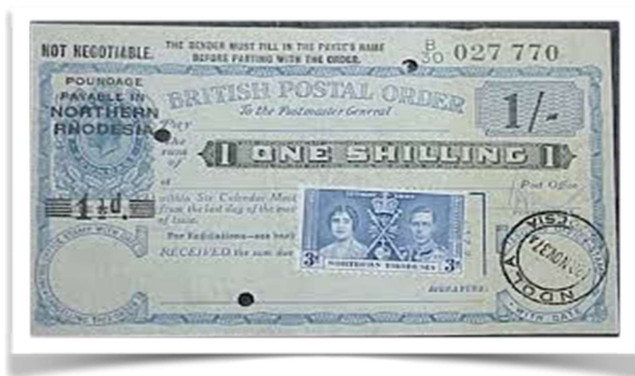
Picture 6: Postal order, Northern Rhodesia

Furthermore, there are banks that provide an instant, online or cardless option to their customers, such as Zanaco Xapit, FNB e-wallet and Barclays e-wallet. Zanaco in particular has a strong background in mobile money and has made significant investments in its successful Xapit programme that has been operational since 2008. Xapit has proved popular amongst farmers, traders, suppliers and the general public. Part of this popularity lies in the fact that internet access by mobile phone is not necessary, the software having been designed and tailored to also cater for low-income groups. Zanaco works in partnership with Airtel Zambia to provide Xapit. To further expand their outreach, Zanaco also uses the country's postal service, Zampost—reaching the unbanked population through their service known as Zanaxo Xpress.