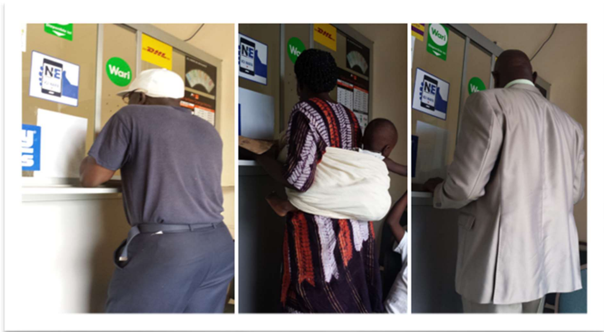
Picture 3: At the same mobile money agent and within 30 minutes of each other, different “user profiles” carry out a transaction, Pikine Savenelles. LARTES-IFAN.

The choice of these two cities can be explained by, among other things, the need to understand actors in a highly urbanized city (Dakar) and a relatively rural one (Louga). Money transfer services have developed rapidly in the informal sectors of Dakar's suburbs and in other areas with high emigration rates such as in Louga. The team focused on the influence of the informal economy and the effects of migration in the use of mobile money. They also concentrated on what mobile money was most used for, leading them to focus on (small) daily transactions. These types of transfers are vital, especially as regards everyday expenditure, and can inform clients' choice of products.