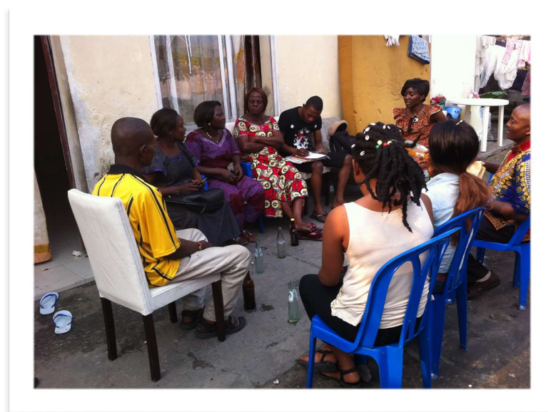
Picture 2: Focus Group held amongst a group of saleswomen ( vendeuse de feuilles de lianes), Kinshasa.