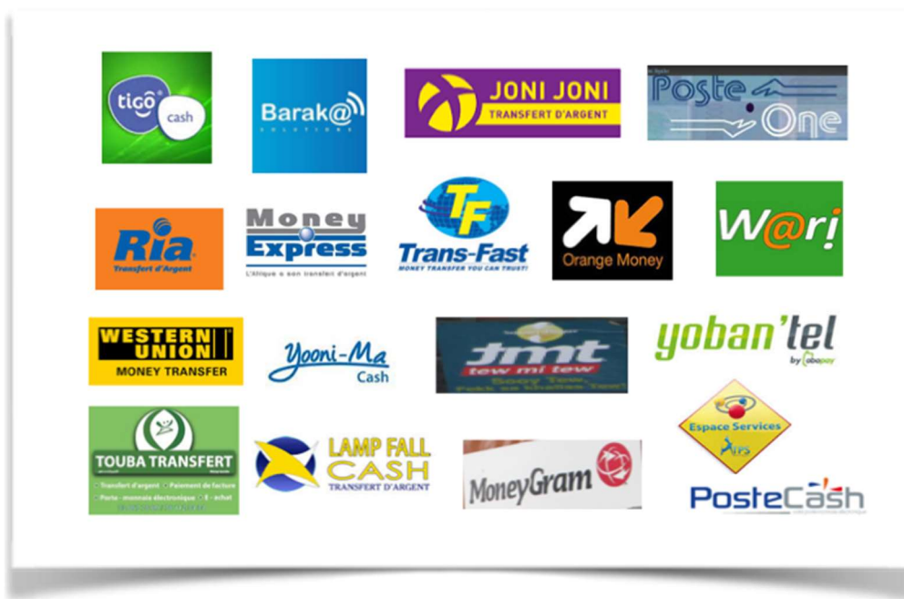
Fig 1: Advertisements for mobile money are ubiquitous in the African cities that we visited in recent months (advert compilation by the Dakar team).

Digital financial services have developed differently in Cameroon, Congo DRC, Senegal and Zambia. This differentiation in the development of DFS available is linked, to some extent, to the countries' communication infrastructures as well as the regulatory standards as formulated by the national states and supranational institutions. Together with the (potential) users of DFS, these services and the setting (infrastructure and regulation) in which they exist make up the mobile money ecosystem. This section of the report will give an overview of the “mobile money ecosystem” as the researchers encountered it, and as described to them by their informants. As the approach was to understand mobile money through the eyes of users and non-users, this report lets their voices and opinions precede the researchers' own “outsider” views. For a comprehensive (general) sector-informed overview of DFS ecosystems in the four countries, we refer you to the reports provided by UNCDF/MM4P and GSMA/Mobile Money for the unbanked. 21