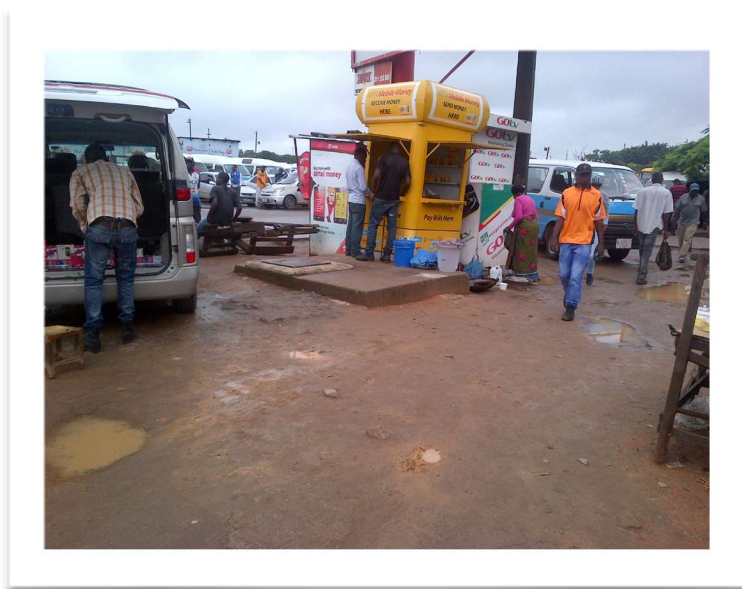
Picture 8: Airtel Money and MTN mobile money kiosks located at high traffic sites near Nkana East/Chambishi bus stations in Kitwe town centre. Edna Kabala

Mr Ngenda points at a scarcity of information about liability to bearers in case of a loss of money in unforeseen circumstances. In his case, the lack of guaranteed consumer protection fosters scepticism about the reliability of DFS. With the rapid expansion of the DFS industry in countries like Zambia, where the number of DFS providers increased from ten in 2008 to 28 in 2015, the industry's regulatory environment has not kept up sufficiently and is often not known to the consumers. 52